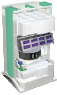
IQAir® Cleanroom 250

The IQAir® Cleanroom Series consists of three high-performance air cleaning models ( Cleanroom 100, 250 and H13 ). Each model is specifically designed for the removal of solid and liquid airborne particles and aerosols. Due to their certified and guaranteed high filtration efficiency, the systems are predominantly used for airborne infection control in health-care settings and for the control of particulate matter in cleanroom-type applications.